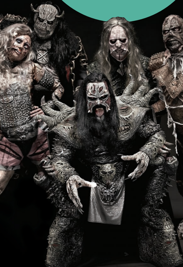
CLAIRE AHO 19 April – 21 July, London

The Photographers' Gallery presents Claire Aho: Studio Works , the first solo international showcase of Aho's photographs, a pioneer of Finnish colour photography and a key cultural figure in her homeland. This exhibition will focus on Aho's 1950-70 studio based works, displaying images from the world of advertising, editorial and fashion, alongside original Finnish lifestyle magazines featuring her cover pictures.